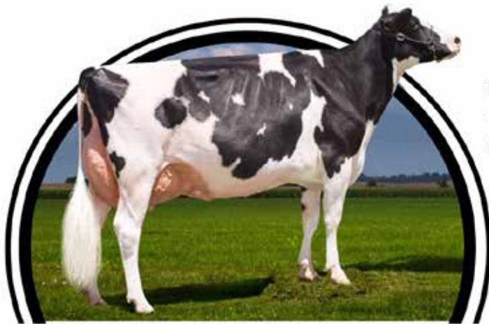
“Utag Windbrook Eclipse” 2018 GRAND CHAMPION

Send to terlou38@gmail.com by the 24 th of each month.